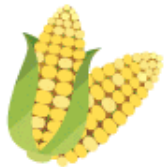
1. Sweet Corn*

The Top Fruits And Veggies That Have The Fewest Pesticides