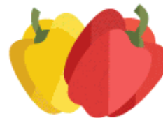
11. Sweet bell peppers