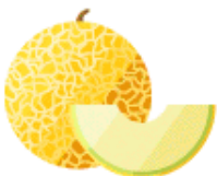
11. Honeydew Melon